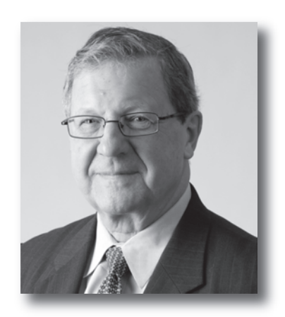
Lloyd Axworthy is currently Chairperson of the World Refugee Council. He has held several federal Cabinet positions, including Minister of Employment and Immigration and Minister of Foreign Affairs. He is also a member of the Commission on Global Security, Justice and Governance, and international Co-President of the World Federalist Movement — Institute for Global Policy.

Our contributions to peace operations and to refugee system reform can provide important reasons for other UN member states to view positively Canada's candidacy for election for a two-year term on the UN Security Council in 2021-22.